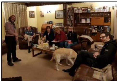
Housegroup - one of the Wednesday groups