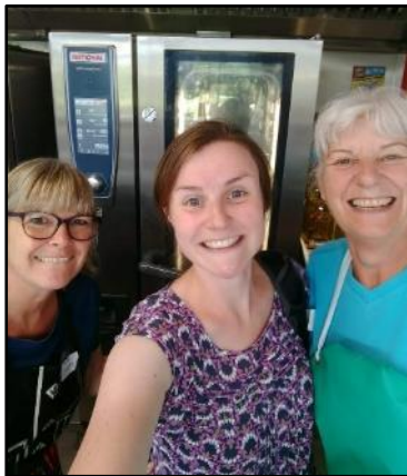
The Foremarke3 cooks celebrating 'working' ovens

Last August found me heading out for my third-year as a cook on a Venture, my second one at Foremarke3. This CPAS Venture holiday for young people (members) aged 14-18 was held at Foremarke Hall home of Repton school – the school building is a mix of high-tech new and manorial old set in beautiful grounds close to the Peak district. Our venture theme this year was a Superhero journey through the bible from start to finish.