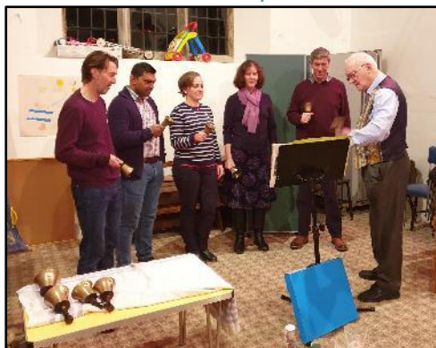
Ringers Christmas party - trying the hand bells

We have managed to keep the bells ringing on a regular basis on the first and third Sunday mornings of each month as well as for weddings and special occasions in the Church year. Sadly we have been unable to ring during the "coronavirus" lockdown,