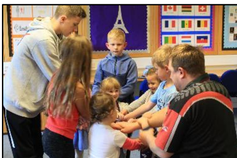
Children enjoying time together

The All Saints All Together weekend was very enjoyable. The venue, food and organisation were all excellent. It was really good for our fellowship, bringing together the church families of Riseley and Bletsoe. Please give thanks for our church and pray for continued growth.