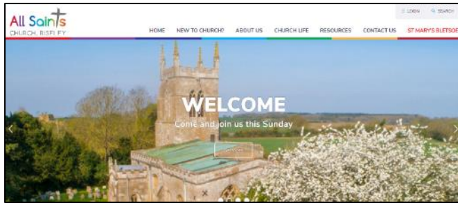
New All Saints website – coming soon

In today's culture a website is so often the first point of contact that somebody has with any company or organisation. And so for many people who have never been to our church, our website acts as the front door, not to just our building, but our church family as it communicates a lot about us and who we are. Many people will make their mind up whether to come and visit us or not, just by looking at our