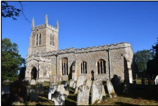
All Saints Church, Riseley

During the past year we have again been successful in keeping our 800 year old church building a warm and welcoming place for people to meet with God and enjoy different types of fellowship together. The building is used for many events during the week in addition to our normal Sunday services including ABC, ADAM, Youth Club, Cubs & Scouts, midweek services, weddings, funerals, bell ringing etc. We obviously have a responsibility to keep the building warm, dry and maintained. Simply keeping the building in good condition requires continual maintenance and minor repairs that are quite costly