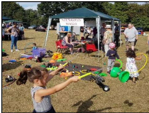
Trying new skills at the Village Show

What an opportunity it is being part of the Riseley Show, especially when it's not raining!