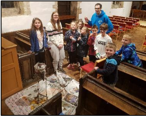
Dropping eggs off the balcony

The youth club runs for school years 4, 5 and 6, every other Friday in the church between 7 and 8pm. We begin with a starter activity followed by “Thinking Time” where we focus on parts of the bible. Last term we followed the 2 Ways To Live, looking at big questions such as Creation, Sin, Judgement, Forgiveness and Heaven. This term we are focussing on Jesus through the eyes of different people who met him such as Zacchaeus, Nicodemus, Pilate and Thomas. The rest of the evening is spent doing an activity such as crafts, outdoor games, circus, treasure hunts, dropping eggs off the balcony, clearing eggs off the floor, etc.