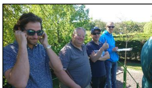
Sporting Targets visit

The Men's Group has continued to meet regularly over the past year seeking to build genuine friendships between men in the village both inside and outside of All Saints Church. The group is a great forum for people to get to know each other in a caring and authentic way.