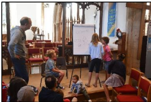
All Dads & Me playing a game

All Dads and me is a monthly Saturday breakfast club for dads and children up to primary ages. ADAM has been a great opportunity to get to know dads and children who are on the fringe of our church family and as a first step to invite to other church events.