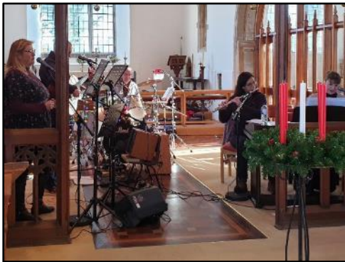
The Music group during Advent

Worship has been described as the highest calling and privilege in the Christian life. When we come together it is an opportunity to celebrate all that God is and all He has done for us. It's an opportunity to deepen our relationship with Him and one another, to experience His love afresh, and to be changed by the power of His Holy Spirit. We bring our heartfelt praise and worship to our amazing God through music and songs, with these being firmly rooted in the knowledge and obedience to the Word of God.