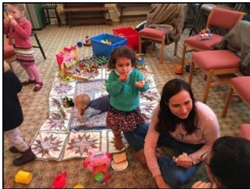
ABC enjoying time with friends

Once a month, friendly team, and gospel opportunity. This is a great outreach for new mums, parents and carers of pre-schoolers. From a mums' perspective it is wonderful to pass the baby around for a cuddle whilst tucking into a bacon sandwich and fresh coffee! From a child's perspective, a friendly and safe atmosphere to play, interact with other toddlers and adults, have fun with crafts, enjoy a snack, story from the Bible, sing and pray. It is a chance for us to witness in our daily lives and share the Good News of Jesus through a creative story time. We have future hopes of perhaps increasing the frequency of our meetings. Please pray for those plans