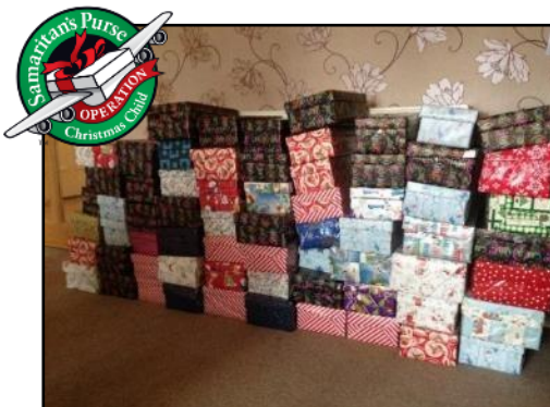
Shoebboxes packed and ready to go

One of the charities that we have been involved with for many years is the Shoe Box Appeal. Filling a shoebox for a child at Christmas is something that is now a church family tradition for many in our congregation and in the wider community.