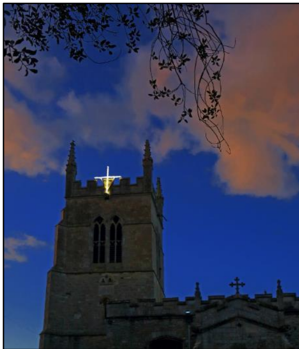
Cross of Glory

Church Lane, Riseley, Bedford, MK44 1ER www.allsaintsriseley.com