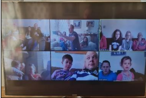
Young people meeting on Zoom

we have not been able to do these things together in person, technology (and paper!) has enabled us to continue our togetherness in the Spirit as we have sung the same songs, prayed the same prayers, listened to the same passages of the Bible being read and reflected on the same sermons each week. The invention of ZOOM has meant we have been able to see and talk to one another for prayer meetings and communion services, for homegroup studies and for Christianity Explored Courses, whilst not been allowed to meet in person. Praise God for technology!