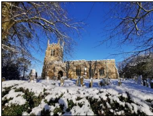
Winter at All Saints